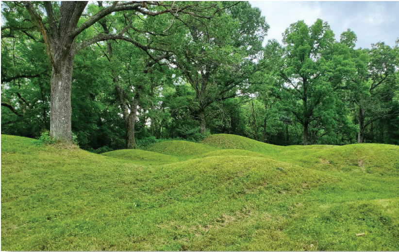
The large mounds were built very close together.