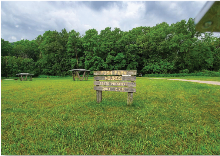
This sign and park is right off the highway. Steps lead to the terrace and mounds.