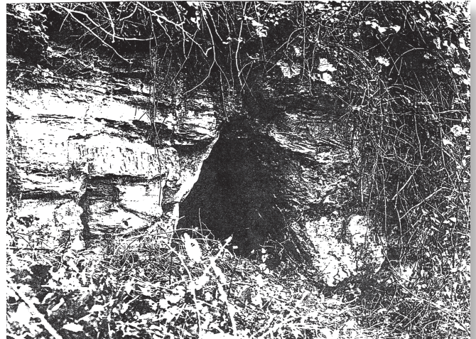
Ellison Orr photographed the Fish Farm's North Crevice in 1934. By 1948 it was filled with silt.

Colsch donated much of his collection to the New Albin Public Library, where it can be viewed when the library is open. The collection includes many stone and ceramic pieces, including spear points, arrowheads, end scrapers, knives, drills, axes, decorated pottery, and pottery rims and handles. The more notable artifacts include a catlinite “bison” pendant, a marine shell bead, some brass beads, a white limestone pipe segment and a chunky stone. The black, ground, chunky stone disk is about eight inches in diameter with a hole in the center. Chunky was a game played between two opponents in which one would roll the stone across the